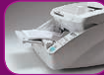
Highest position (100 sheets)

The document feeder has three selectable feeding modes (100, 300 and 500 sheets) that are adjustable according to the volume of the batches being scanned, saving time and increasing overall throughput.