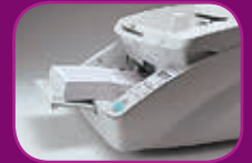
Lowest position (500 sheets)